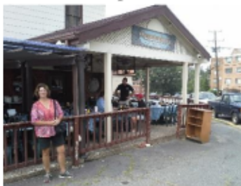
The Quarterdeck Restaurant

With the somewhat inclement weather, we decided to head back to the Capitol area and stop at one of my wife's favorite outdoor sea food joints. Outside the fence line behind Flag Officers Row at Fort Myer, VA, (now JB Myer-Henderson Hall) and just northeast of Arlington Cemetery, sits the Quarterdeck Restaurant, 1200 Fort Myer Drive. It is very hard to find, along with finding parking in a residential apartment area.