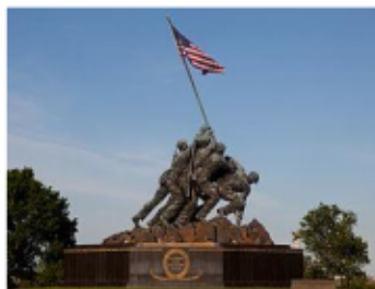
Iwo Jima Memorial

That evening we stayed at JB Anacostia-Bolling Navy Gateway Inns and Suites (NGIS). We stayed there in the past and liked the facilities. With the focus on security, many bases close some gates after business hours, so don't trust a GPS. This base has large Defense Intelligence Agency (DIA) component. Also, the Presidential Marine Helicopter Fleet must now be stationed there, because they were sitting about 300 yards from our building.