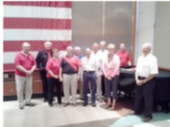
Railsplitters Board of Directors