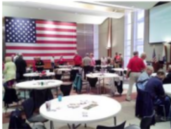
War Memorial Ballroom