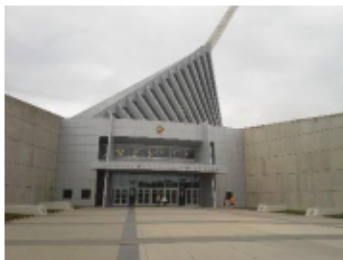
Main Entrance to Museum